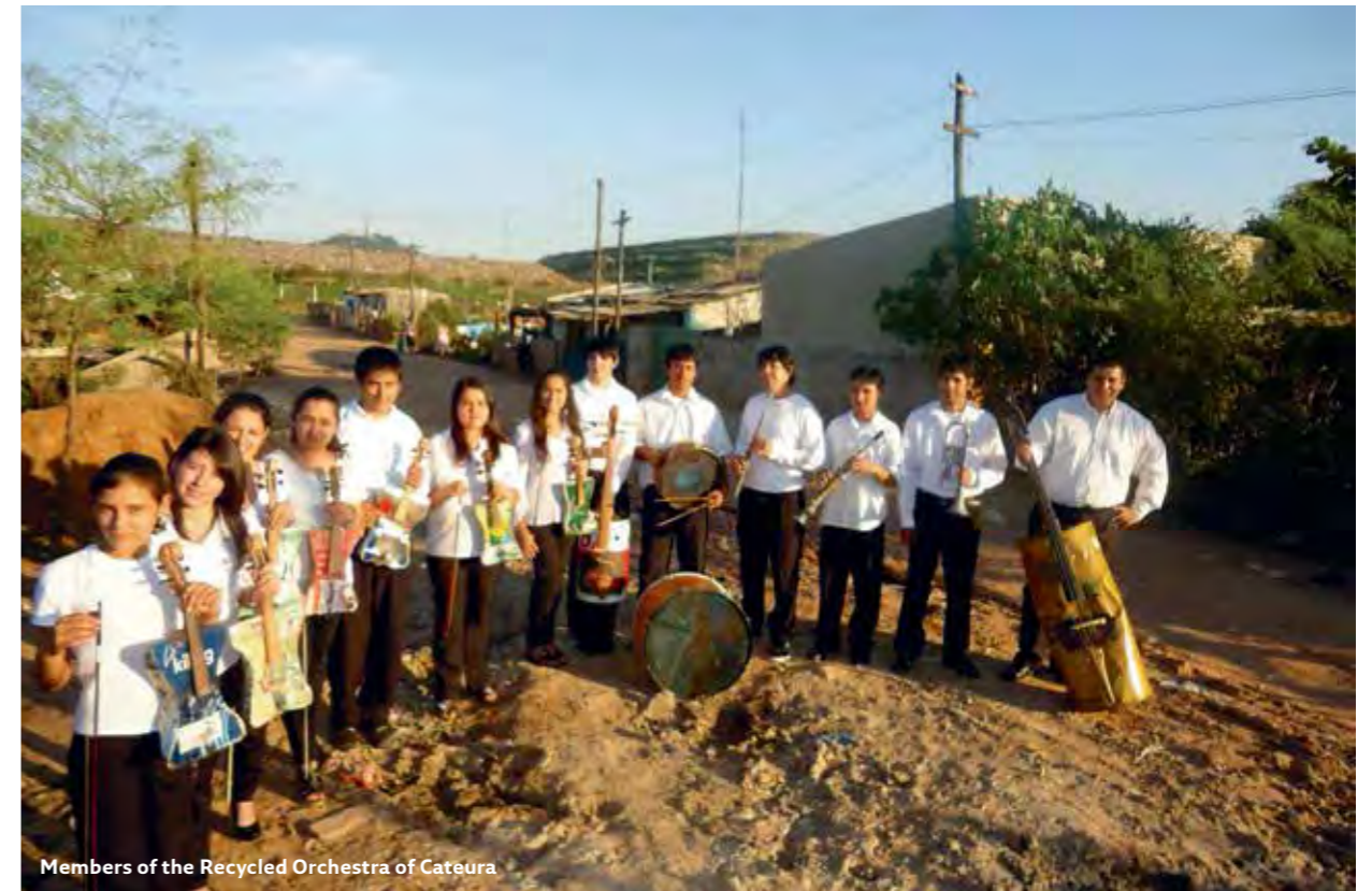
Members of the Recycled Orchestra of Cateura

The Family Weekend offers all sorts of delightful and creative activities for parents, children and people of all ages – a programme sure to engage and excite!